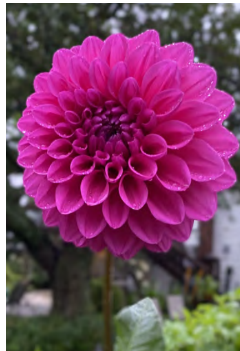
2024 Challenge Flower "Brian .R."