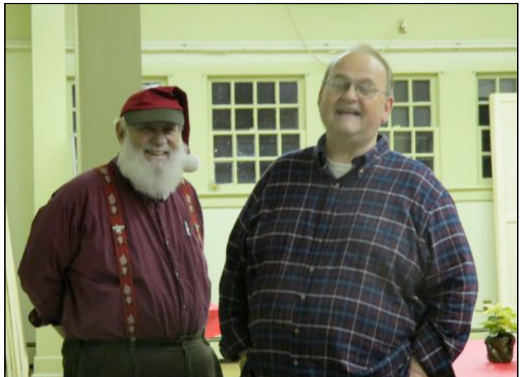
Holiday Party