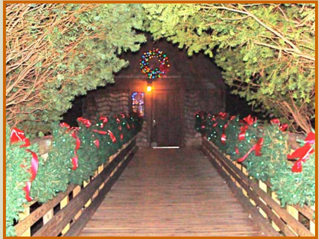
Above: Entrance to the Upper Level of the Carriage House where our Holiday Party is held; decorated by the Bayard Cutting Arboretum Horticultural Society.