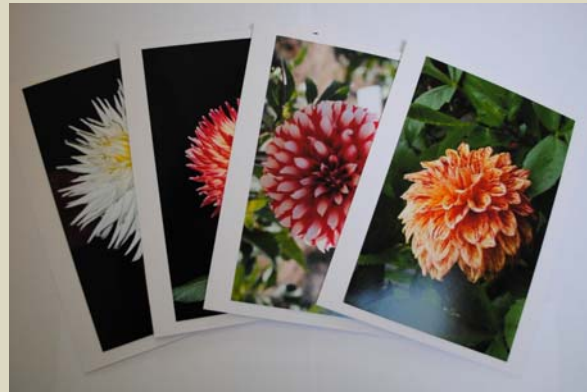
Above. LIDS Note Card Set

If you missed the sale of the dahlia note card sets or would like specific types of pictures like winter scenes, butterflies, or red dahlias for your cards you may e-mail Lynn Schiller at lynns77@optonline.net