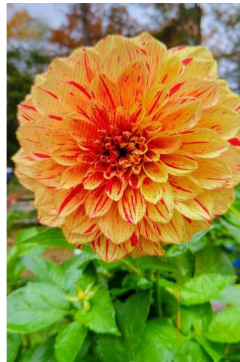
2023 Challenge Flower "Gloriosa"